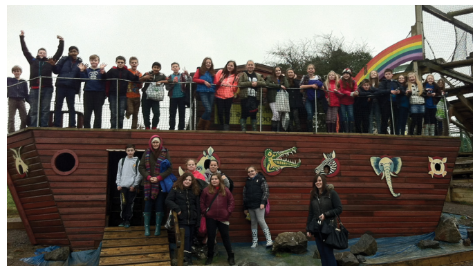
Pupils aboard the ark

This raised pupils' awareness of the role that they can play in protecting and maintaining our natural environment and pupils even had the opportunity to handle a range of animals such as rabbits, baby chicks and even a snake.